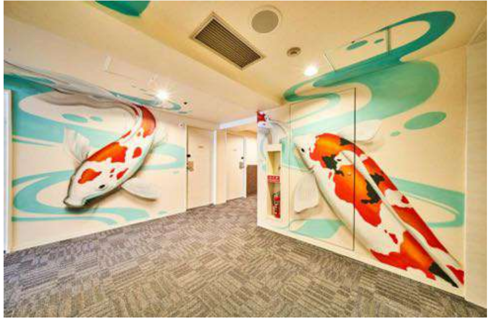
4F JAPANESE CARP