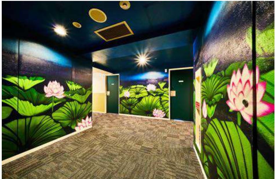
3F LOTUS POND – HASUIKE