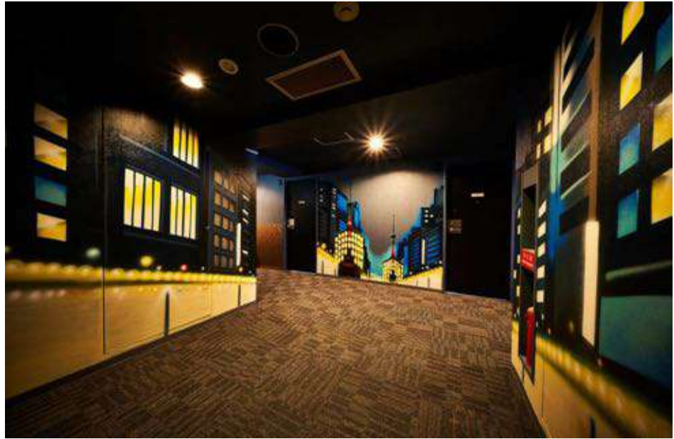
9F FESTIVAL OF KYOTO